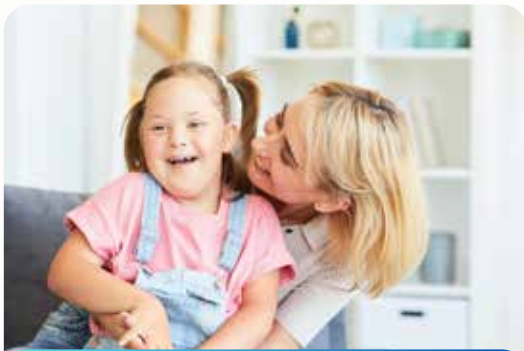
Assist-Life Stage, Transition