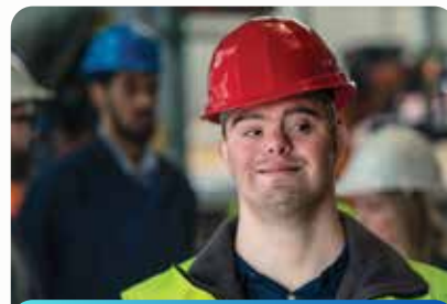
Daily Tasks/ Shared Living