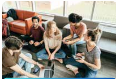
Development- Life Skills